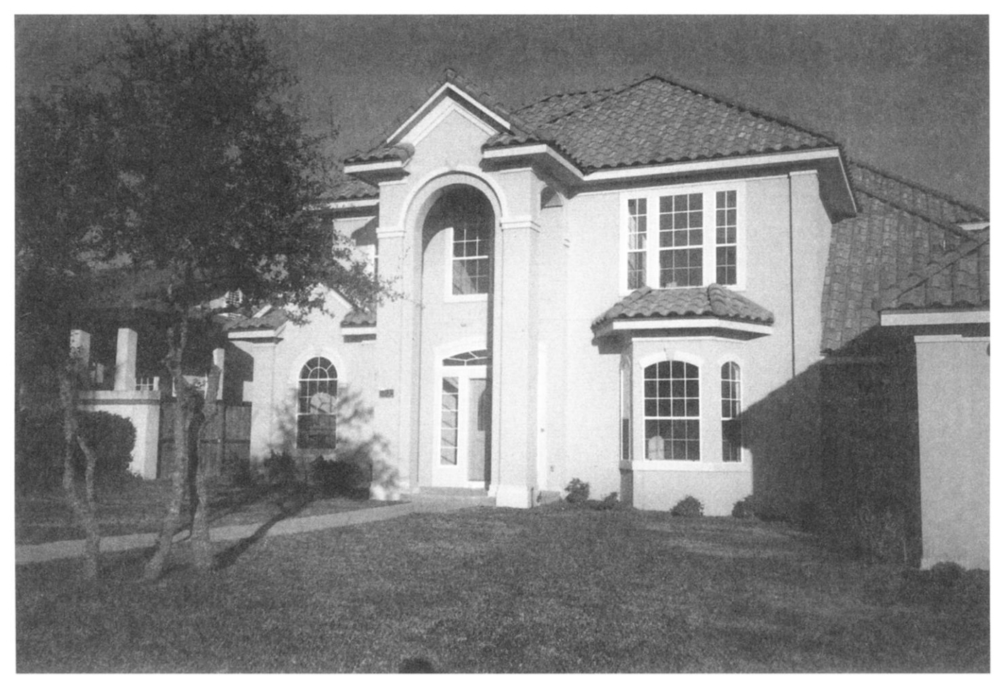
Figure 3. Scottsdale-style house.

communities, interviews with key informants such as the developers and real estate agents, and the collection of marketing, sales, and advertising documents. An unstructured interview guide was developed to elicit residents' decision-making processes concerning their move to the gated community. The research team<sup>7</sup> collected field notes and interviews in the New York area, while I worked alone in San Antonio. The interviews lasted between one to two hours, depending on whether the interviewer was taken on a tour of the house. We did not ask to be taken on a tour, but many times interviewees offered, and we used the tour to learn more about the person's tastes, interests, and preferences.