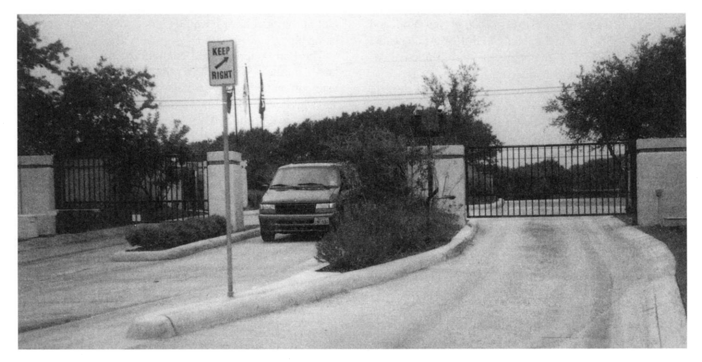
Figure 1. Gated entry.

New suburban housing developments with surrounding walls and restrictive gates located approximately thirty minutes drive from their respective downtown city halls were selected at the edge of each city. Single-family house